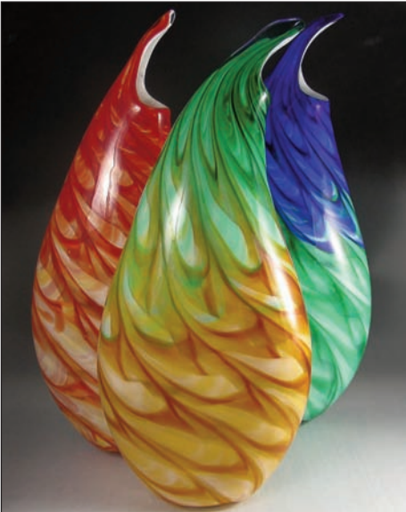
Reeds & Rushes 18" tall $395