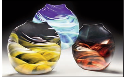
Medallion Vases 9" tall $210

A donation will be made from the proceeds of these vases to the "Voices of the Wetlands" in an effort to save this important ecological treasure.