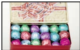
PG. 6 ViViD Celebrations