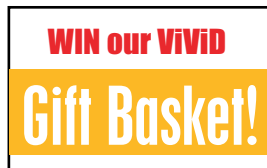
PG. 8-9 ViViD Living