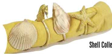
Shell Collection Napkin Rings

Make your primary goal to have a good time with your guests! Consider getting some help with chores you'd rather avoid. Hire someone to clean, cook, decorate, tend bar or do the dishes. Better yet, book a party at South 'n France. We'll take care of everything, allowing you to enjoy your event while impressing your friends with your fabulous taste!