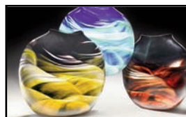
PG. 1 ViViD Artist