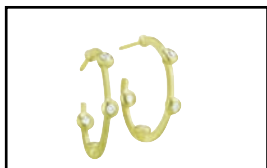
PG. 4-5 ViViD Style