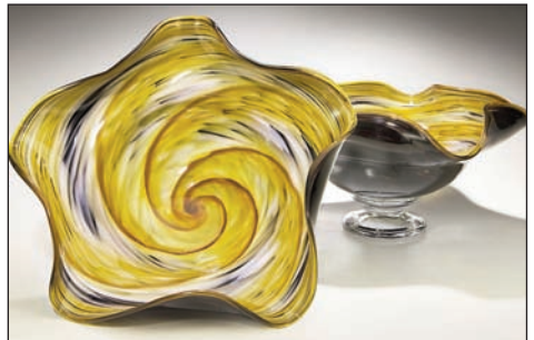
Wavy Bowl $375

A donation will be made from the proceeds of these vases to the "Voices of the Wetlands" in an effort to save this important ecological treasure.