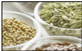
PG. 7 ViViD Recipe