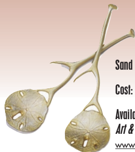
Sand Dollar Serving Set

One of the secrets behind our success is offering a fun and interactive experience. We focus on making crepes or bon bons, which creates instant camaraderie and conversation. Organize a tasting party or have guests create their own pasta or pizza with gourmet toppings. Simple group games like holiday bingo, Pictionary or Bunco liven up the festivities