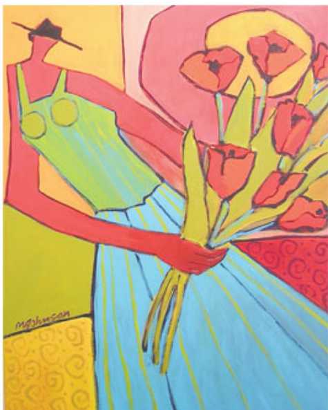
SPRING FLOWERS by Mandy Johnson (acrylic on canvas, 24 x 30) is showing at Spectrum Art Gallery.